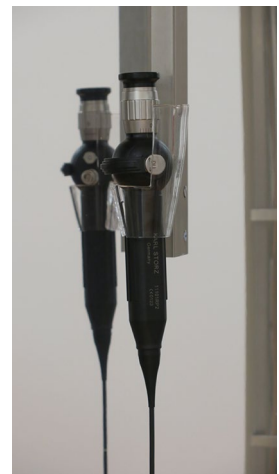
Fig. 2 Close-up of the endoscope holder with a FE

Dirt, debris and grime are not penetrable for the germicidal effect of the UV-C light. Hence, all endoscopes must be optically clean before using the UV light system.