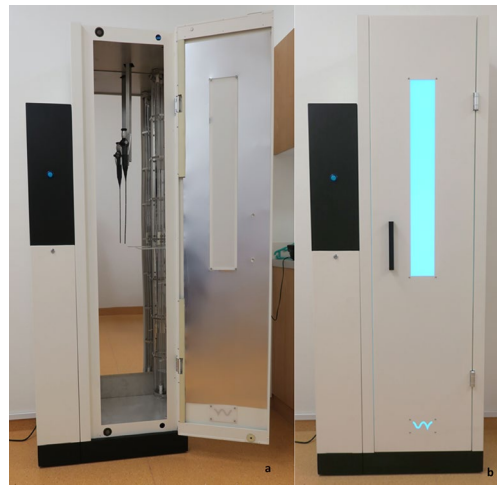
Fig. 1 a Arrangement of a FE in the D60. b Sealed D60 while reprocessing a FE

The UV technology used in the D60 light system (UV Smart Impelux™ technology) works at a wavelength of 253.7 nm. An application dose of 1962 J/m 2 is delivered in each cycle. According to internal investigations of the manufacturer, the applied UV-C dose does not affect the surface of the endoscope. Nevertheless, it causes DNA and RNA destruction in irradiated microorganisms on the endoscope.